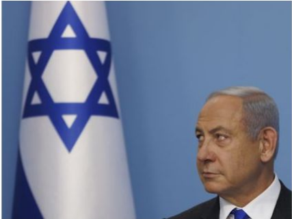
QuickTake What to Know About Netanyahu's Far-Right Government in Israel