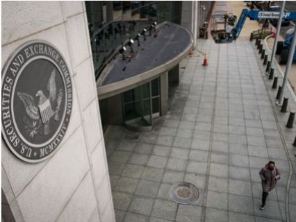
ESG How to Understand the Correction in the ESG Fund Market