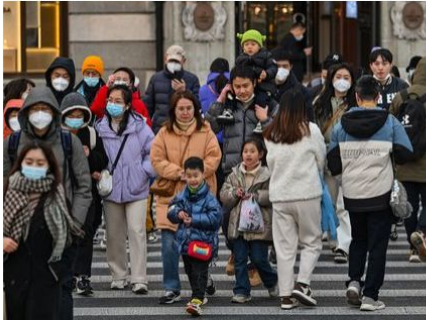
QuickTake What China's Falling Population Means for the Country's Future