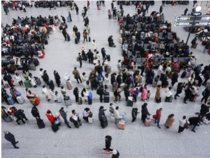
QuickTake What's Next for China's Covid Surge as Millions Trek Home for Lunar New Year